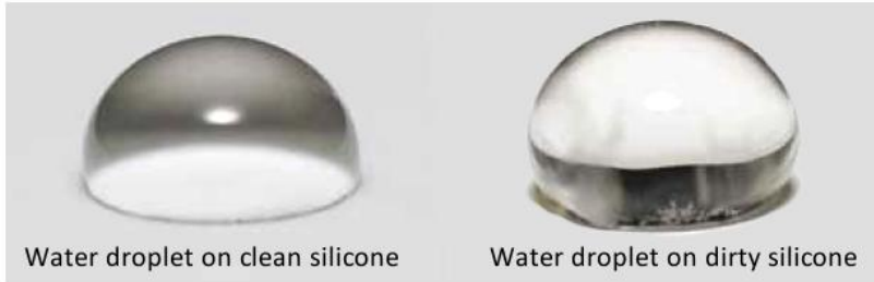
Water droplet on clean silicone

Silicone exhibits very good long lasting water repellency, also known as Hydrophobicity. Silicone also has the ability to transfer water repelling effects to pollutants, this Radiform® hydrophobicity transfer